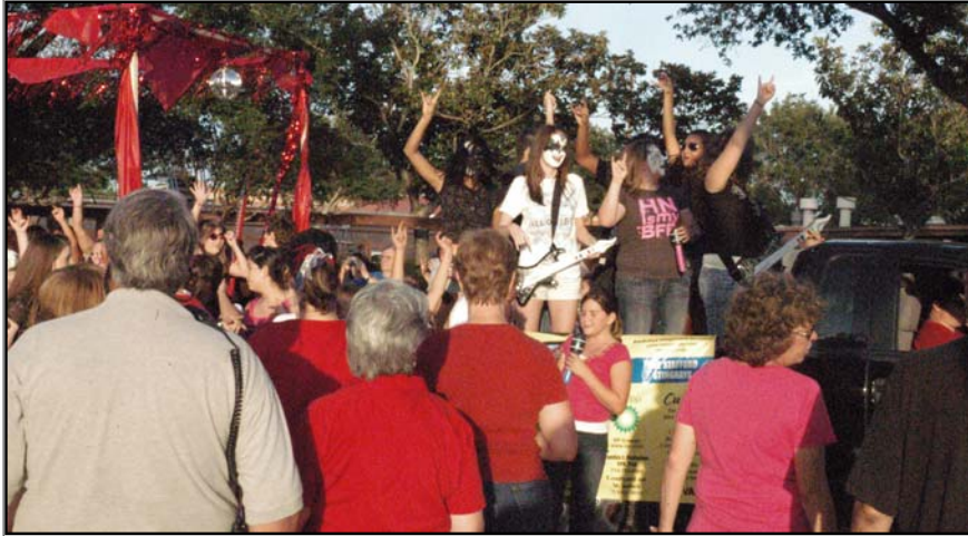
July 2008 Parade

For the 34 th consecutive year, Stafford is preparing to celebrate Independence Day. The event continues to grow, with something extra special being added this year: A Patriotic Concert by the Fort Bend Symphony Orchestra at the Stafford Centre Performing Arts Theatre on July 4 will complement our celebration.